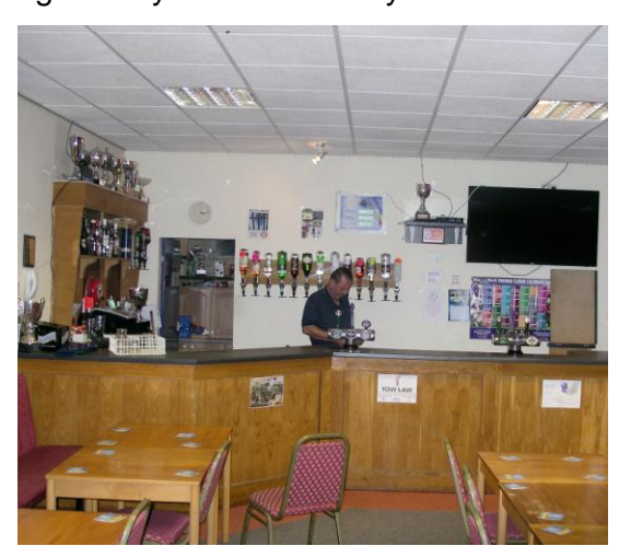
Tow Law Town FC Clubhouse

The Clubhouse continues to thrive, open every night, match days and Sunday lunchtimes