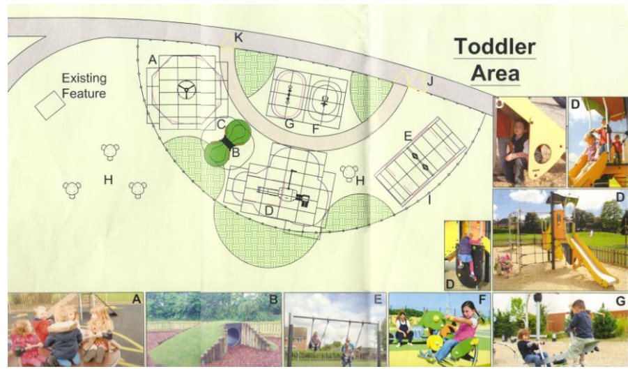
Plan of the new Playground