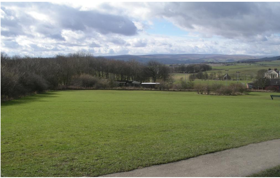
The proposed area for the new Playground

We hope to have the latest news on this project in the next edition.